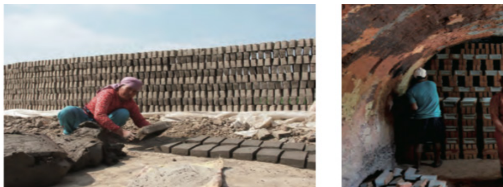
Figure (Fig. 2): Traditional Brick Industry

Additionally, the timber and bricks used in these structures are quite unique in nature. The bricks used are called maapā and dātiapā . 20 They are traditional fire bricks, the production of which, although declining, is still in existence today.